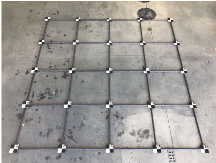
Figure 1: Sample image covering the calibration test field