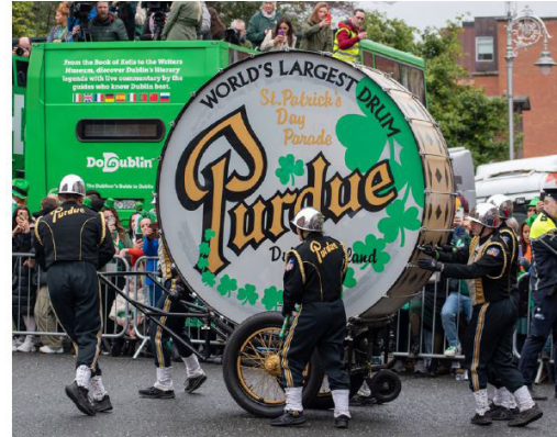
The Drum Crew during the St. Patrick's Day Parade in Ireland in 2023.