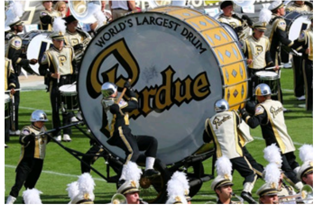
The Drum Crew performing "spins" and "kick-hits" inside the block-P during the pre-game show.

All Crew Members must demonstrate the balance, strength, speed, agility, and endurance required to handle the Drum safely and effectively. The Drum weighs 565 pounds with the carriage and if handled improperly, can become a danger to us and those around us. This is why safety is the Crew's number one priority and why members must be able to control the Drum. Typically, when operating the Drum, there are two Crew Members in the front and two in the back.