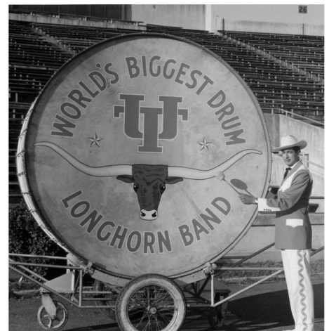
Big Bertha at UT Austin