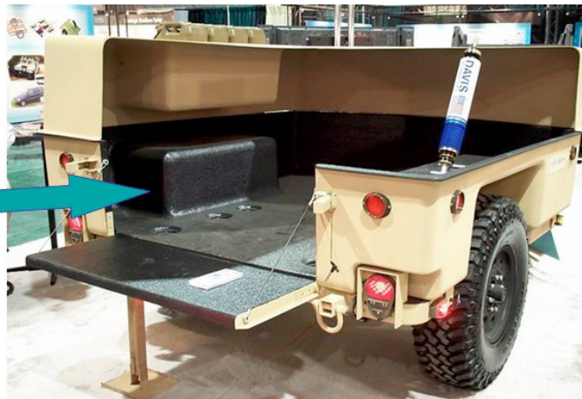
Figure 1: Mold Filling Simulation of a Tractor Trailer Bed through a center line gate injection with last regions to fill at the corners. Such simulations can be integrated in Digital Twin Designs in the Future for Industry 4.0 Manufacturing