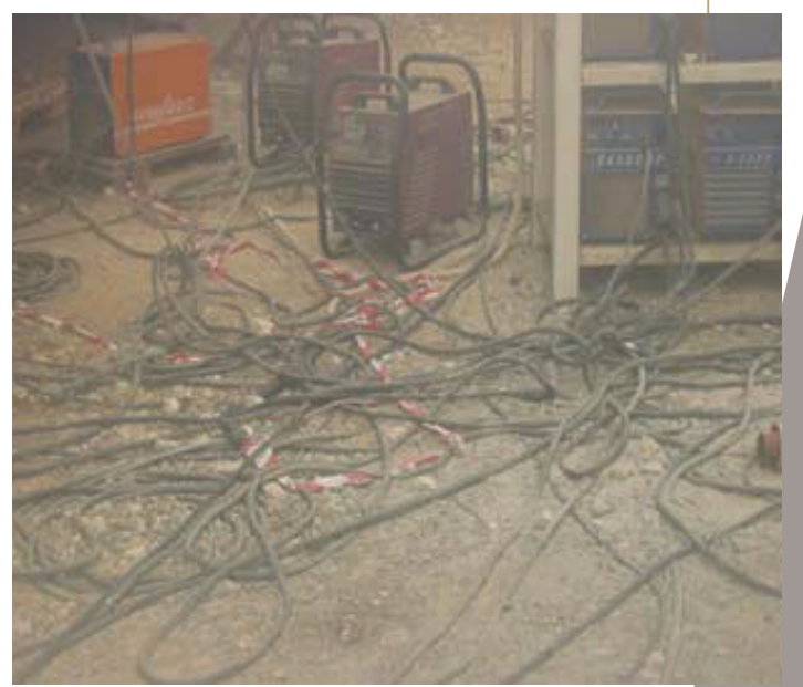
An example of poor housekeeping during a construction project.