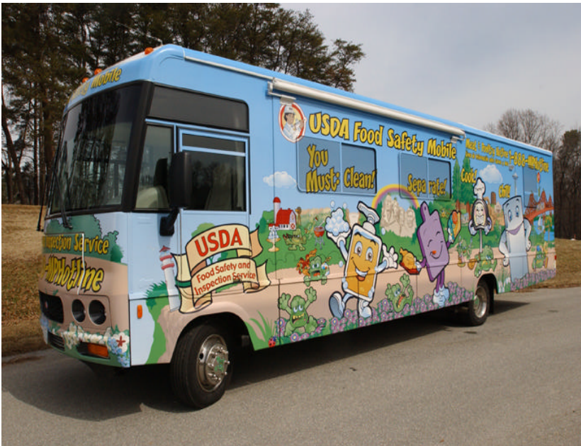
Food Safety Mobile exhibits colorful USDA's FIGHT BAC Campaign's message