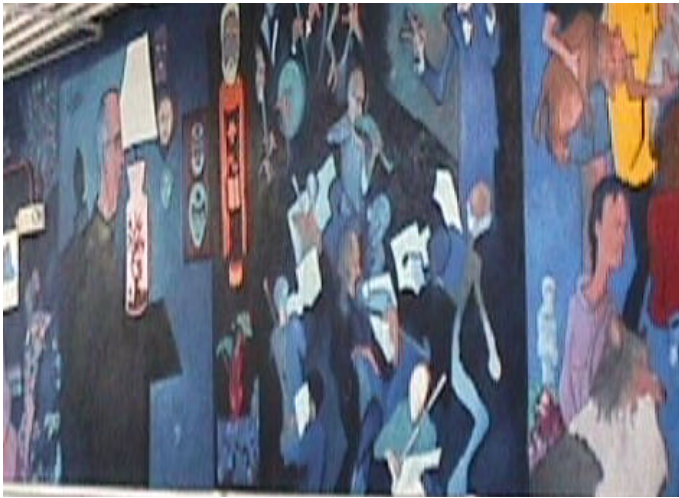
One of several beautiful murals painted by Alfred Eakerand at St. Vincent's Client Choice Food Pantry

As the shoppers proceed through the pantry with carts, they can read labels on cans and packages and make informed choices about what they select. (This is client choice!)