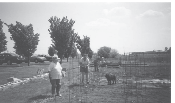
Master Gardeners in Tippecanoe County Planting A Row for the hungry.

Hoosier Hills Food Bank claims that even in the smallest spaces, planting an additional row of vegetables for giving away, can make a genuine contribution to the community. Whether light vegetables like snap beans, or dense vegetables like