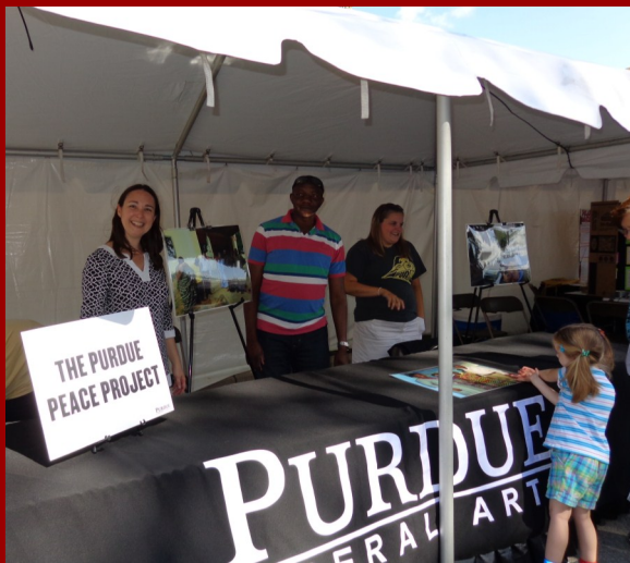
Greeting guests and talking with them about PPP.