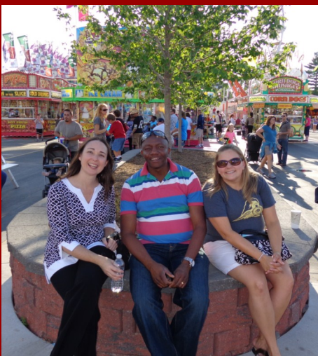
Enjoying a little rest at the end of the day.

The Purdue Peace Project was one of three programs selected to represent the College of Liberal Arts on Purdue Day at the Indiana State Fair in August. Purdue Day is an annual event at the fair that features various schools, colleges, and programs of the university. This year twenty different organizations were represented.