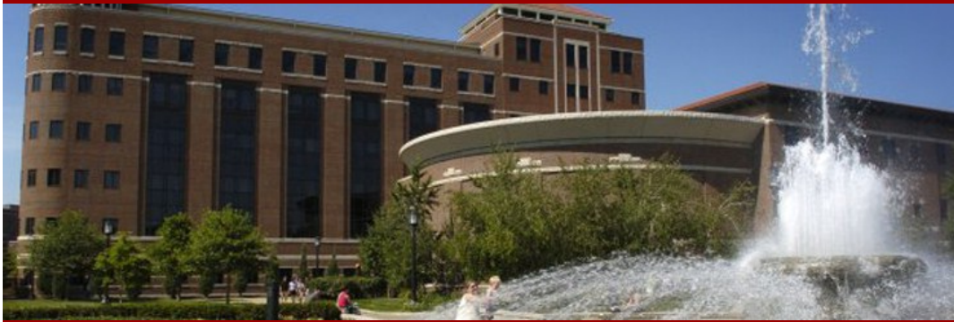
Beering Hall of Liberal Arts and Education, Purdue University