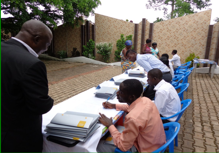
Registration of meeting participants