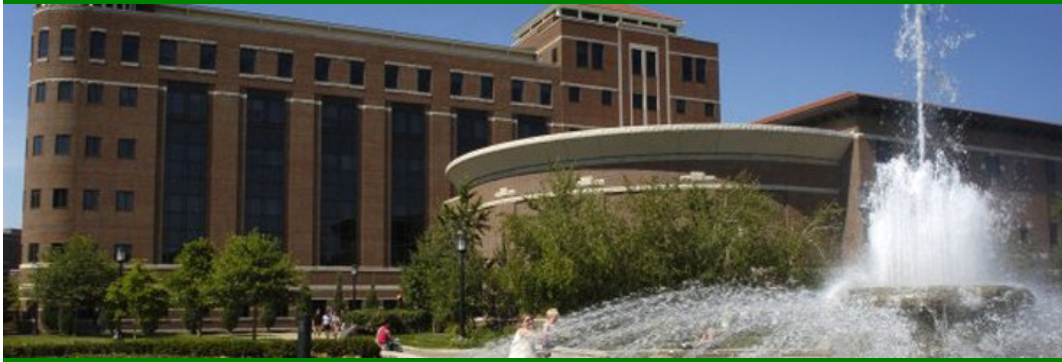
Beering Hall of Liberal Arts and Education, Purdue University, West Lafayette, Indiana