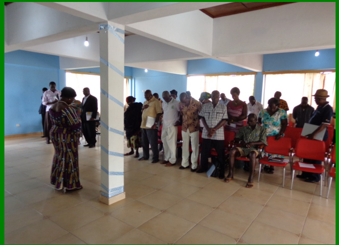
Prayer prior to meeting start, a regional tradition