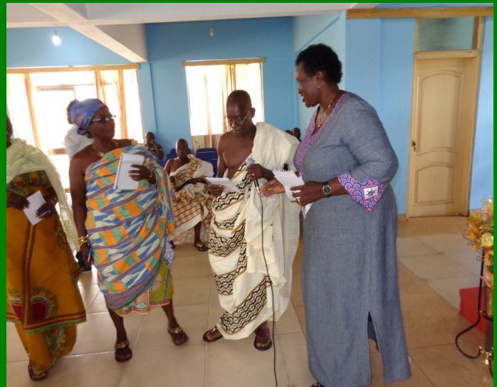
Sharing of strategies for conflict prevention