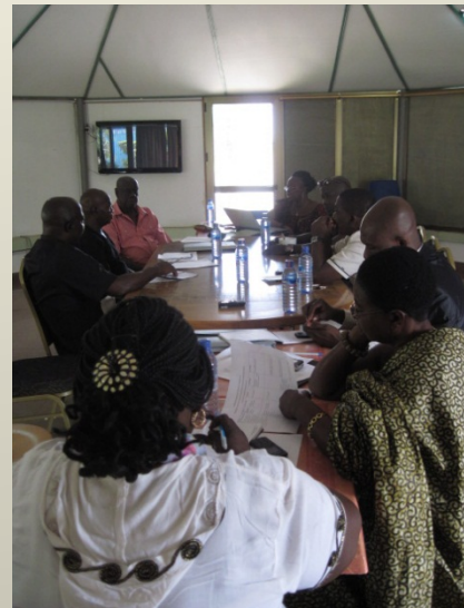
Ghana – Local Peace Committee