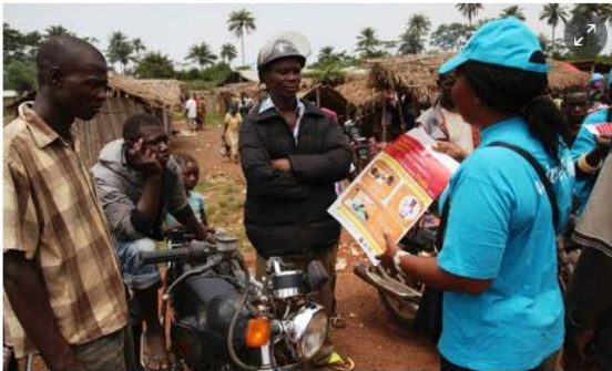
Motorcycle taxi drivers are a good means of disseminating information during the Ebola crisis in Liberia

The Liberian government responded slowly to the Ebola crisis, asking the international community to do what some have argued it should have done itself. Now, there are indicators that the government is dependent on the goodwill of