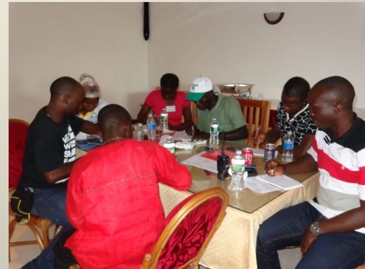
Liberia – Pen-Pen Drivers Project