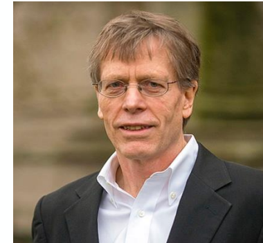
Lars Peter Hansen

This world-renowned economist is a senior fellow at Stanford University's Hoover Institution who writes "The Grumpy Economist" blog from a free-market point of view. Cochrane is the Daniels School's first Dean's Distinguished Lecture speaker; he will visit campus to talk about inflation and more Oct. 1.